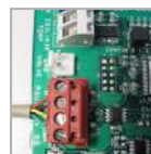
Figure 3. AquaLink RS 485 Communication (4-Wire Connection)