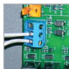
Figure 2. AquaLink RS or Remote TSTAT Connection (2-Wire Connection)